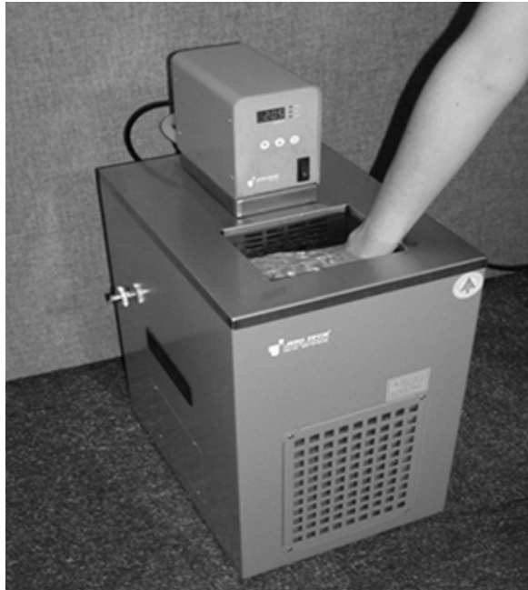
FIG. 2. Cold Pressor used in the pain experiments.

used, with each participant undergoing three cold pressor trials. Stimuli were presented in counterbalanced order, and test conditions in the experiments were as follows.