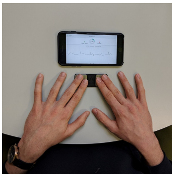
Figure 1: ECG monitor connected to the smartphone application.

Ethics. The experimental methodology used in this project adheres to the ethics regulations of the University of Edinburgh and the setup was reviewed and authorized by the School of Informatics Ethics Panel. All subjects signed a consent form, which confirmed their voluntary participation in the data collection procedure.