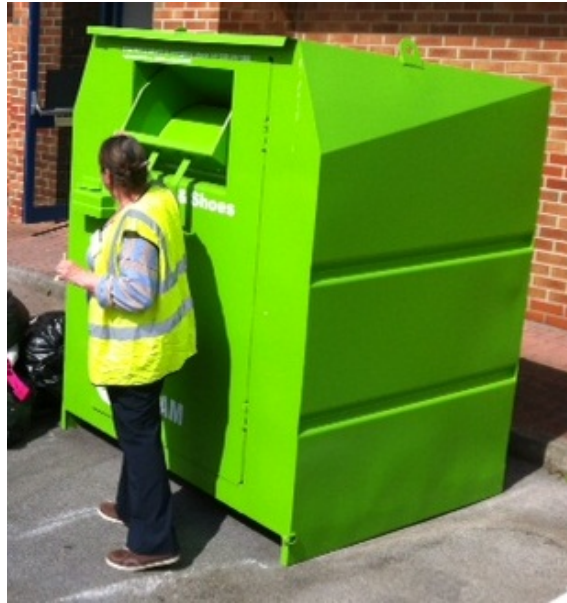
Figure 1 – Charity donation bank

A perceived problem with the fixed collection rounds often used in charity logistics, and a problem experienced in this case study, is that some banks may contain relatively few items when visited, while other banks may have been full for several days before a collection was made. In this case a more dynamic and flexible collection scheduling approach may be appropriate particularly where containers fill at highly variable and unpredictable rates, or, where unnecessarily long trips to only partially filled banks are being made (Johansson, 2006). This more dynamic and flexible approach can be enabled through remote monitoring of banks and other assets, Remote monitoring may also help in identifying incidences of theft from banks and could, in principle, affect the collection policy (e.g. visit more frequently), although this aspect has not been considered here.