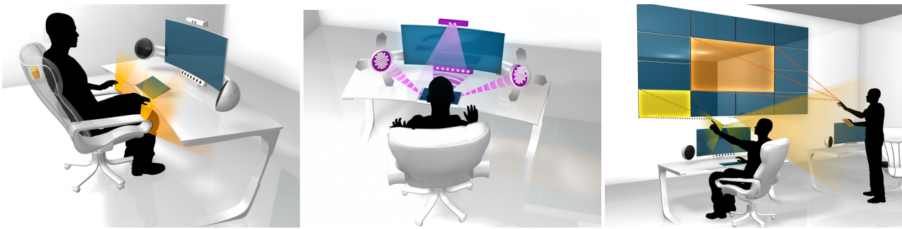
Fig. 2 Left: Comfortable sensor-equipped chair. Micro gestures allow for natural interaction during lengthy passive monitoring periods. Middle: Operators at workstations are tracked and an acoustic interface targets sound at a particular operator without disturbing others. Right: Collaboration and distribution of urgent tasks via hand gestures and shared screens.

gamification, while an obesity monitoring agent should use motivational feedback to improve user compliance.