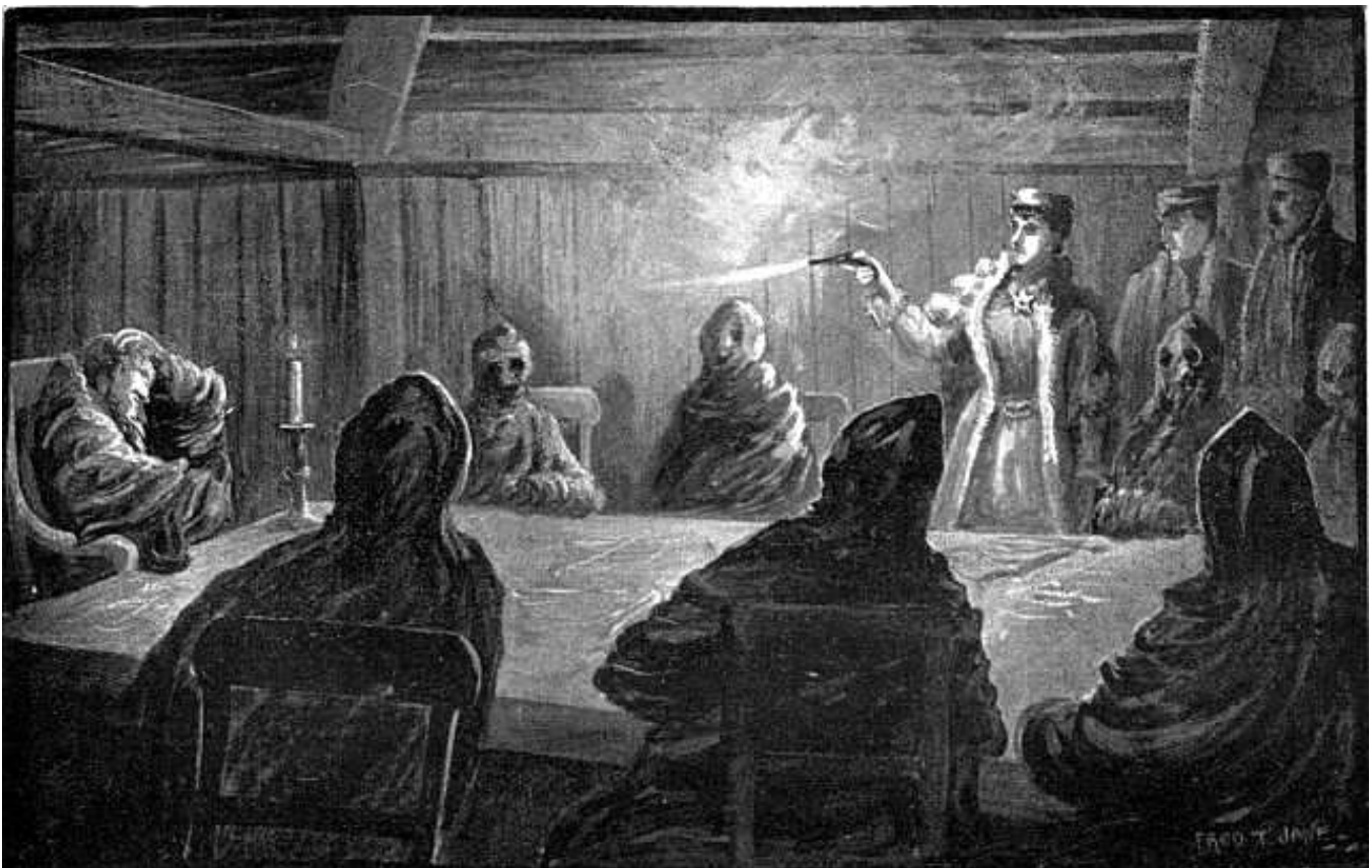
Figure 4: Illustration for The Angel of the Revolution

But one should remember that in Nihilist texts the English protagonist, if present at all (something one could by no means take for granted), rarely fulfilled the role of the faithful servant of the state around which the spy genre would shortly coalesce. Far from being a police spy himself, he was, in fact, sometimes sympathetic to the Nihilist cause, even to the extent of joining a terrorist organisation. Griffith Jones's The Angel of the Revolution (1893) is the prime example (Fig. 4). More typical still were protagonists who committed to carrying out an assassination on behalf of a secret society and then had a change of heart: their mental deliberations and emotional turmoil were given respectful attention. Secret political organisations were, after all, qualitatively different from the enemy states bent on invasion found in future war scenarios. It was possible to empathise with the point of view of an aggrieved hero or heroine who joined them, whereas only a contemptible traitor would sell British secrets to the Kaiser. Analogously, agents of a friendly foreign government who took part in international secret police collaboration to hound dangerous revolutionaries appeared in a different light from the agents of hostile