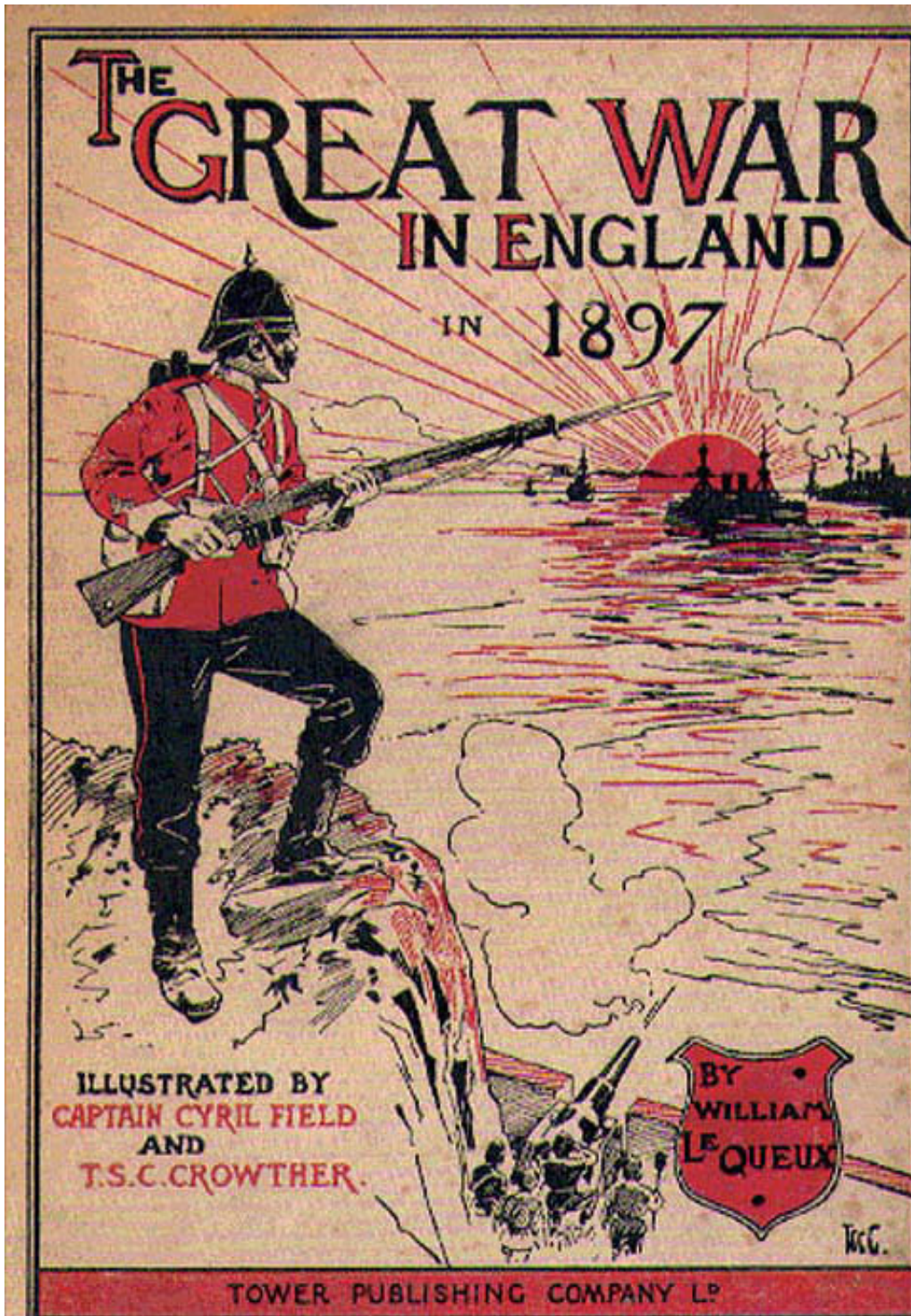
Figure 3: The Great War in England cover

As can be seen from the titles alone, these spies were not the kind readers immediately think of today—pieces in the great chess game of international diplomacy, guardians or subverters of national security, agents of intelligence bureaucracies and state secret services. But in the 1880s and especially the 1890s, as European imperial rivalries and arms races heated up, various approximations to the type began to crop up here and there, and most obviously, in the imaginary invasion narratives that had proliferated since the 1871 publication of George Chesney's The Battle of Dorking . [5] In The Great War in England in 1897 (1894), published in book form three years before the title date (Fig. 3), William Le Queux introduced a figure that would become the prototype of the foreign spy for the next several decades—a British-based German Jew “in the secret pay of the tsar” who