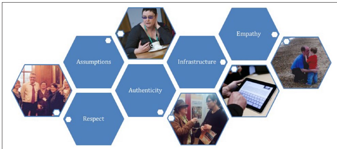
Figure 1. Current topics in participatory autism research.